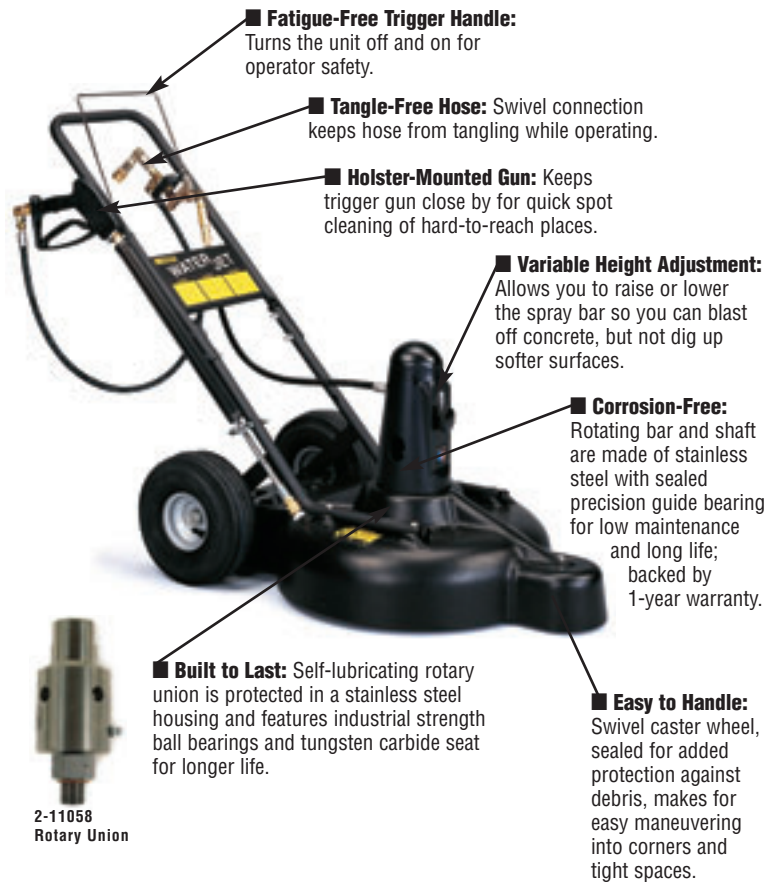
2-11058 Rotary Union