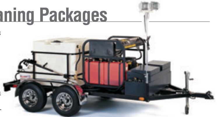
TR-6000 double-axle trailer shown with optional pressure washer, fuel and tool box, work lamp, chrome fenders and wheels

Landa has two trailer-mounted wash systems for on-site cleaning, a single-axle trailer with 200 gal. water tank and a double-axle model with a 330 gal. tank. These top-quality packages allow you to customize the trailer to your needs by mixing and matching trailer beds, pressure washers and a wide selection of options and accessories.