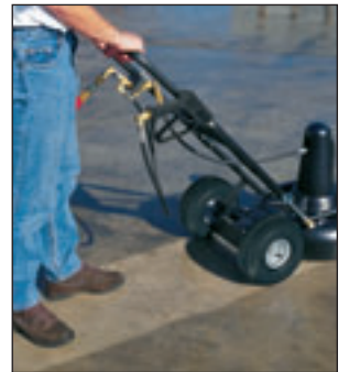
The Water Jet attaches to a hot or cold water pressure washer and cleans flat surfaces fast using a water-propelled spray bar that spins at 2000 RPM